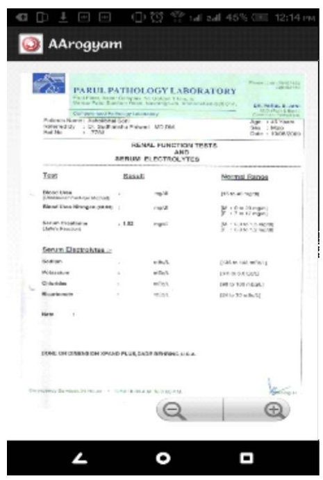
Fig. 3: Report Transfer

Patients can upload their various medical reports during consultancy with doctors. Also doctors can analyze those reports during the follow up with the patient. These medical reports will be transferred from one system to other in encrypted form. For the encryption of the medical reports AES algorithm is used which will protect the confidentiality of the user and only the authorized person can access it. The history of such uploaded medical reports can be viewed by the doctor for further treatment.