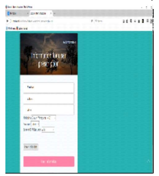
Fig. 4: View Prescription

After the follow up consultancy through video conferencing doctor can send the online prescription to the user which will provide the information about the medicines, the frequency and the time of intake.