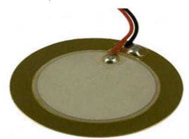
Figure: Pressure Sensor

A piezoelectric sensor or pressure sensor is a device that uses the piezoelectric effect to measure pressure, acceleration, strain or force by converting them to an electrical charge. Piezo buzzer exploits the piezoelectric property of the piezo electric crystals.