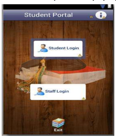
Figure 2: Student & Staff Login

The proposed concept is implemented and the screenshots of the step by step process is given in detail under this section. This will help the researchers to proceed in a proper path during implementation.