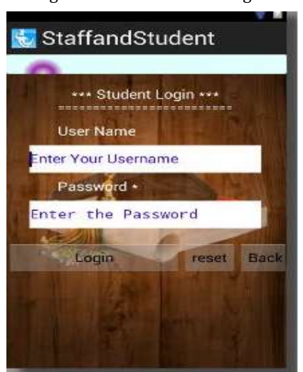
Figure 3: Student Portal