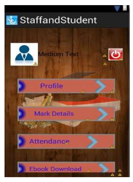
Figure 4: Student Profile