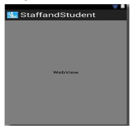
Figure 6: E-book download