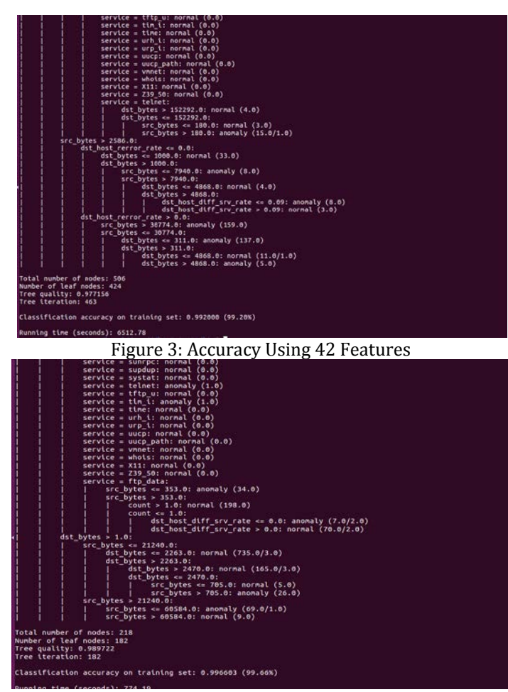
Figure 4: Accuracy using 21 features

Table 1 shows the classification accuracy when consider the 41 features (full features) and the selected features which are selected by the ACO algorithm. Totally 10 experiments have been conducted for training and testing datasets. Five experiments were conducted separately for the training and testing datasets.