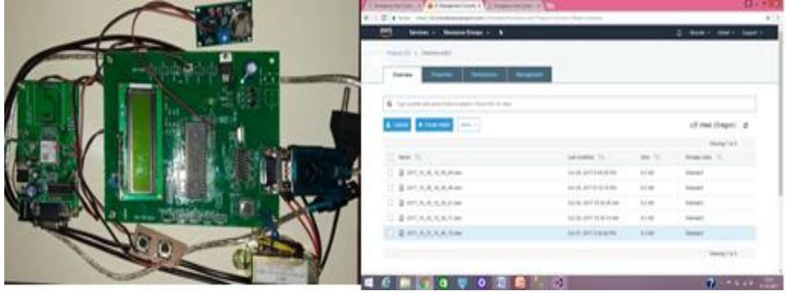
Figure 2: Working of alert system

Hence our proposed framework will be helpful for the way toward sparing human life at an early time period. The smoke sensor identifies the smoke and sends alert to the public service sector. Similarly, the required button sends alert to the appropriate public services. The messages will be sent speedier to get the service from the PSS. The message is transmitted to the appropriate services through the GSM module from the PIC microcontroller which displays the location of the building where the accident has occurred [12]. The status of the framework is shown on the LCD screen. The historical backdrop of services requested by the people will be stored in the cloud database and can be retrieved later to see that for the better advancement of that building.