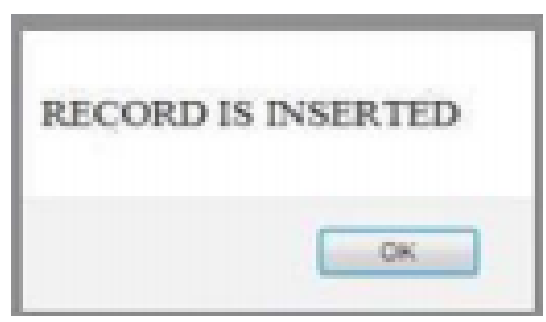
Figure 6: Record Inclusion

In the event that we allot the activity in need booking approach to cloud, we get a yield accurately and in a matter of seconds. The sum or cost will be decreased and moved to cloud proprietor of the utilizing of cloud. Fig.6. indicating that the record is embedded in cloud and Fig.7. demonstrating the significant parameter like preparing time which is for instance as 0.399 seconds.