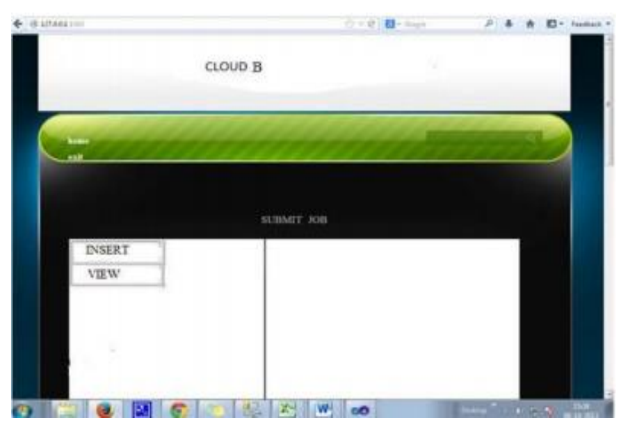
Figure 3: Cloud B Formation