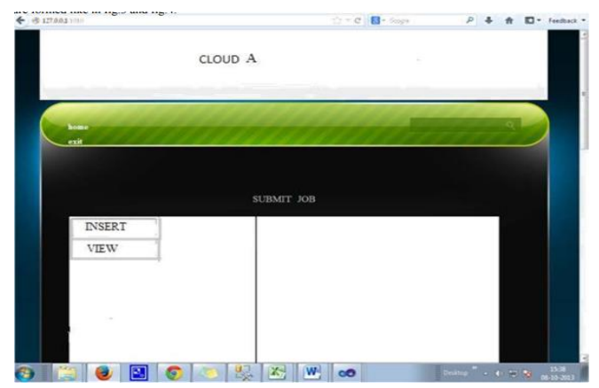
Figure 2: Cloud a Formation

In our project, the server calculates which cloud doing which job. That is controlling the access of cloud, calculation of cost also sharing of works in cloud equally. So first, to determine it, servers or cloud are formed like in fig.2 and fig.3.