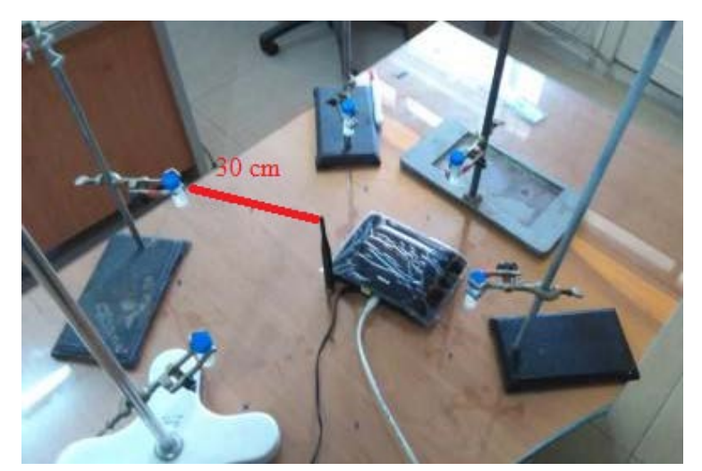
Figure 1. Wi-Fi router position and its proximity to the samples